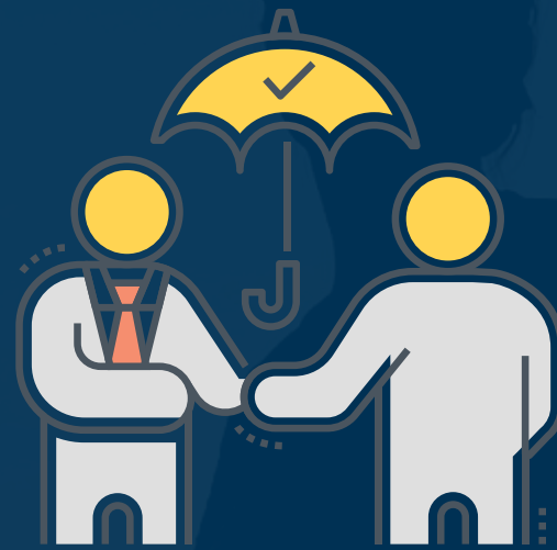
DIRECTOR AND OFFICER'S LIABILITY INSURANCE